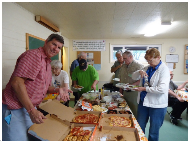
PIZZA NITE AT THE CLUB

At the October meeting, you will be asked to vote on whether to keep life memberships as a member classification or not. Please come ready to discuss it and to vote on the proposal.