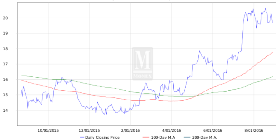
1-Year Historical Daily Closing Prices Last price as of 13-Sat-2016: $19.69