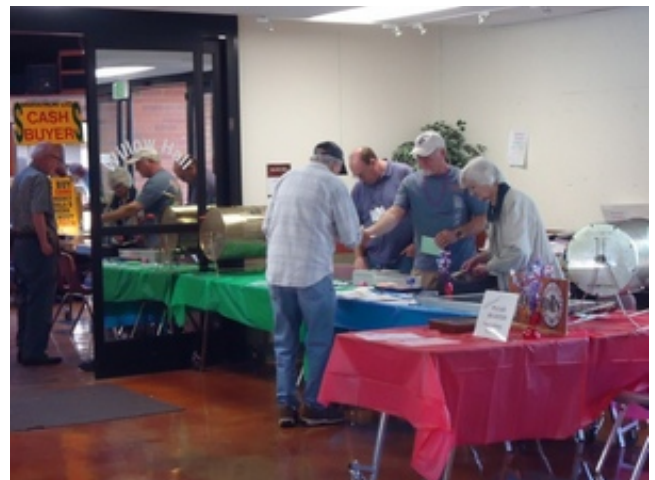
The Team At Work