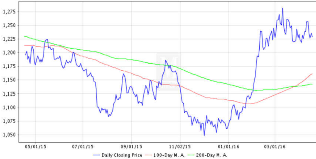
1-Year Historical Daily Closing Prices Last price as of 18-Apr-2016: $1,229